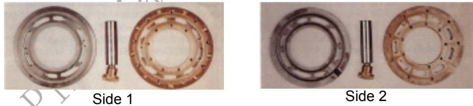
Figure2.Sunstrand Series 22 Axial Piston Pump Parts After Running 225 hr with UCON Hydrolube HP-5046D

High-Pressure Hydrostatic Drive Test , UCON Hydrolube HP-5046D proved itself to be a very stable fluid with excellent lubrication properties under the high-pressure conditions of the following test.